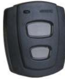
Personal Duress Pendant